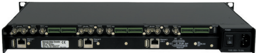
19", 1U Network Video Encoder Rack Solution